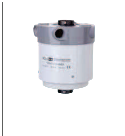
Slip ring box