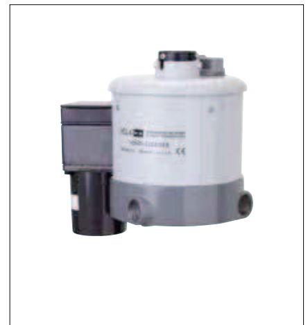
Motordriven slip ring box VCL at the bottom