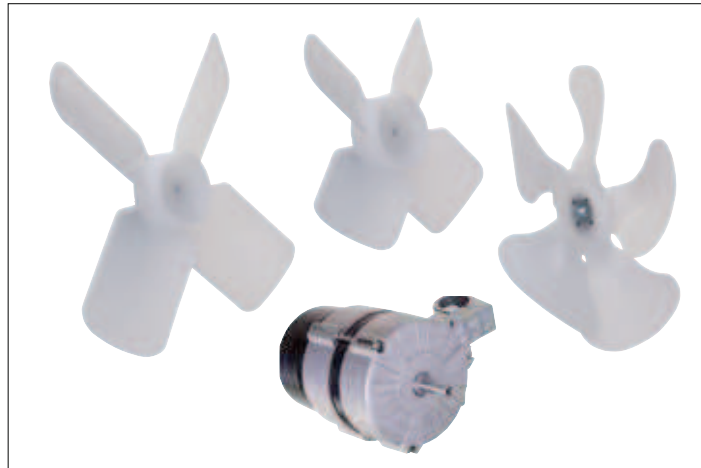
Fans: Ø 200, 230 and 280 mm

The VCL 5 system ensures that the knitting machine remains absolutely clean during the production process. The VCL 5 system increases knitting machine efficiency because it prevents the build-up of contamination and deposits which might otherwise stop the machine. The VCL unit consists of a slip ring box, a support arm and electric fans. The slip ring box feeds a continuous power supply to the fans and is available with and without a motor power drive. Various support arm lengths are available. The fan angle can be adjusted for optimum cleaning. Various fan diameters are available. These three factors means that the VCL 5 can customized to fit practically any knitting machine.