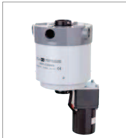
Motordriven slip ring box VCL on top