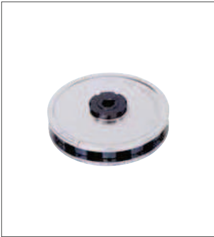
Single adjustment pulley Ø 175 mm

Our adjustment pulleys are made from solid steel. With an easy-to-read scale they enable fine, precision adjustment. A range of diameters are available from 175 to 280 mm and there are versions for one or two drive belt levels. Drive shaft diameter 17 mm and 19 mm.