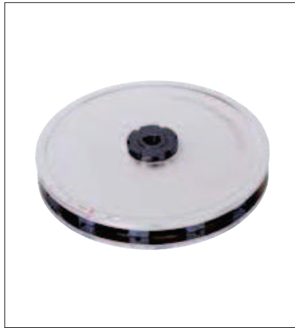
Single adjustment pulley Ø 250 mm