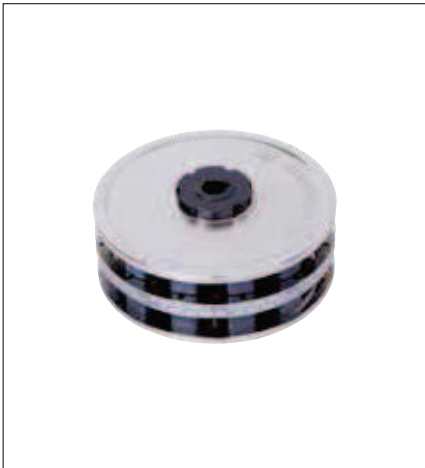
Double adjustment pulley Ø 175 mm