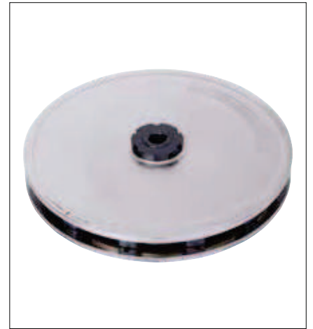
Single adjustment pulley Ø 280 mm