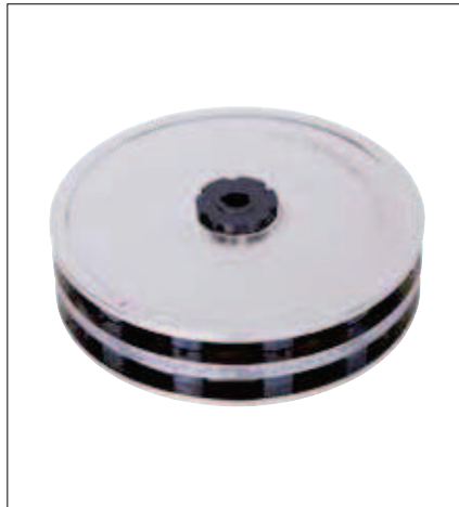
Double adjustment pulley Ø 250 mm